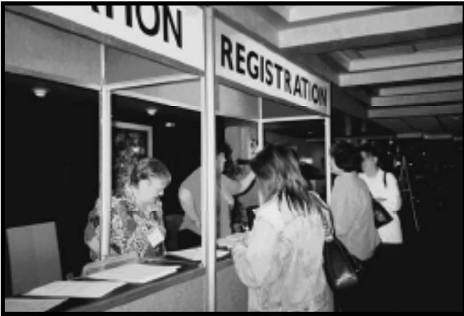
Registration booth at the meeting was a busy place all day.