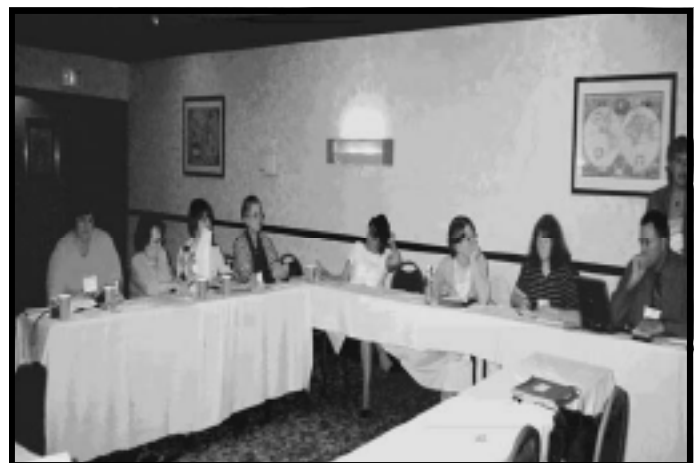
ASCLS-PA House of Delegates Annual Meeting . One topic they discussed was the name change of the organization.